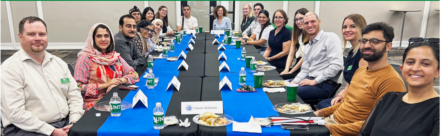
J-1 scholars and students at International Affairs Fall Fulbright Luncheon.