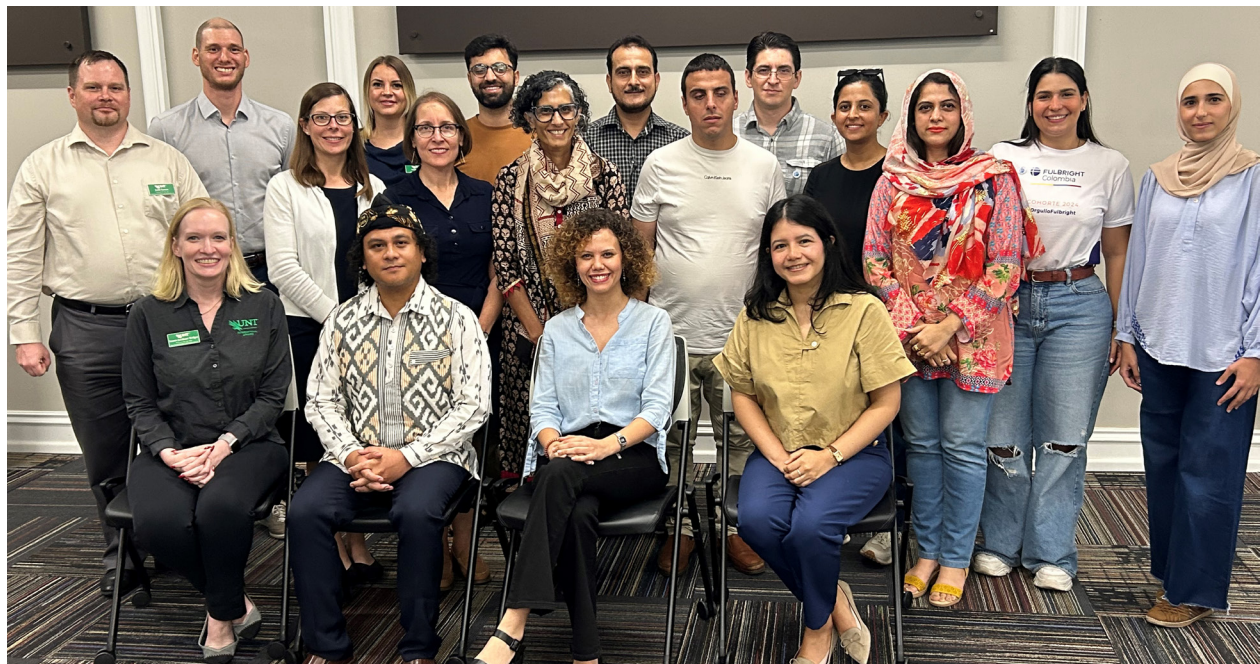
J-1 scholars and students at International Affairs Fall Fulbright Luncheon.