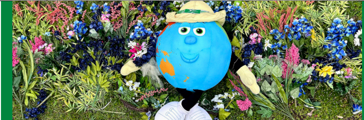
Globie is ready for spring in Texas!